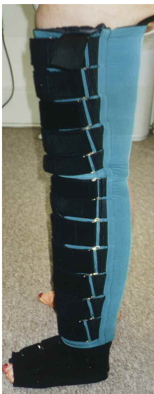
Bandage alternative compression device.

Because lymphedema is a chronic condition, patients must receive self-care education for daily management to avoid lymphedema destabilization, which can lead