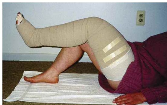
Daily exercise with patient wearing compression bandage.

Exercise always must be done with adequate support to counteract fluid formation. During the intensive CDT phase, limbs are bandaged to provide complete around-the-clock containment. Gentle exercises encourage blood flow into the muscle; during muscle contraction, this creates a favorable internal pressure that effectively squeezes the subcutaneous space between the bandage wall and muscle. Because every bandage strives to provide a gradient of support, fluid tends to drain proximally to the bandage—in most cases, to the trunk.