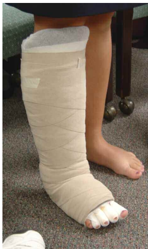
Multilayered short stretch-compression bandage on lower leg.

Compression bandaging provides tissue support after MLD to prevent reflux, slow new fluid formation, and mechanically soften fibrotic areas. Bandaging techniques provide a high working pressure to harness the muscle and joint pumps as a propellant for lymph while resisting retrograde flow created by gravity and centrifugal forces during movement. Pure cotton materials coupled with specialized padding create a soft, castlike environment, which confines swollen tissues without constriction. By relying on high working pressure and low resting pressures to decrease limb