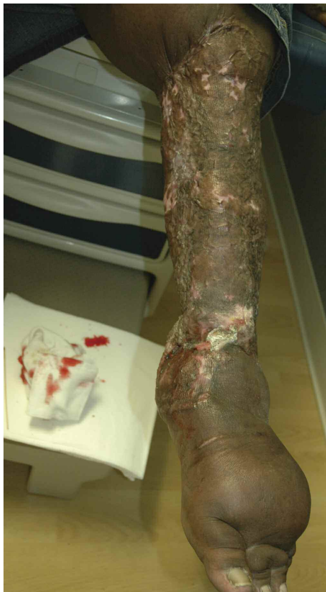
Radical Charles procedure, showing debulked lower extremity.

Currently, the gold standard for lymphedema treatment is complete decongestive therapy (CDT). Michael Foeldi and Etelka Foeldi, who originated this method, discovered a unique symbiotic relationship among