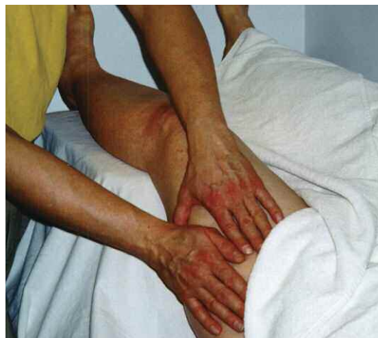
Practitioner performing manual lymph drainage.

A type of soft-tissue mobilization, MLD provides skin traction, stimulating superficial lymph vessels and nodes. Lymph capillaries contain large inter-endothelial inlets called swinging tips, akin to overlapping shingles. Each overlapping cell is tethered to the interstitial matrix by anchoring filaments, so