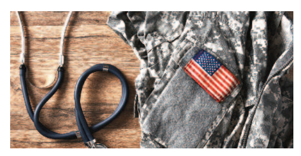
Wound Repair and Regeneration.

"Medicare-VHA dual use is associated with poorer chronic wound healing<sup>D</sup>" was a retrospective study that followed 227 Medicare-enrolled individuals who used the VHA and who had a chronic lower limb wound. Individuals were followed until the wound was healed or up to 1 year.